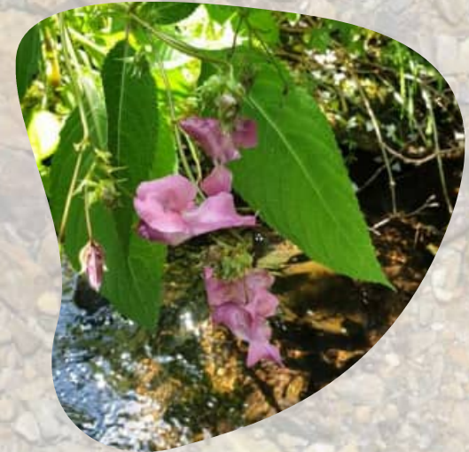
Reducing Non-Native Species