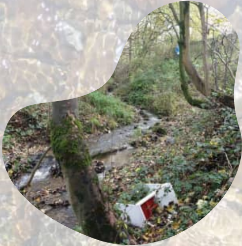
Improving River Habitat Quality

Together with volunteers we have conducted river surveys and desk top studies to help create a road map for improving the River Worth, addressing six key themes: