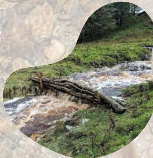
Naturally Reducing Flooding