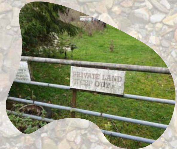
Improving Access To The River