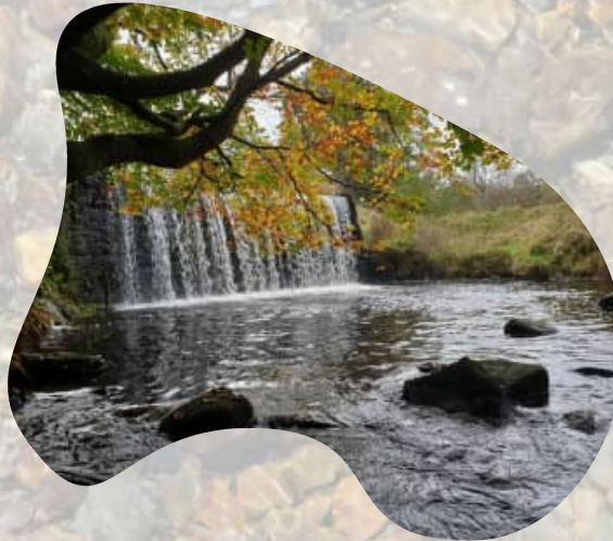
Easing Barriers To Fish Passage