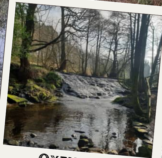
OXENHOPE MILLENNIUM GREEN